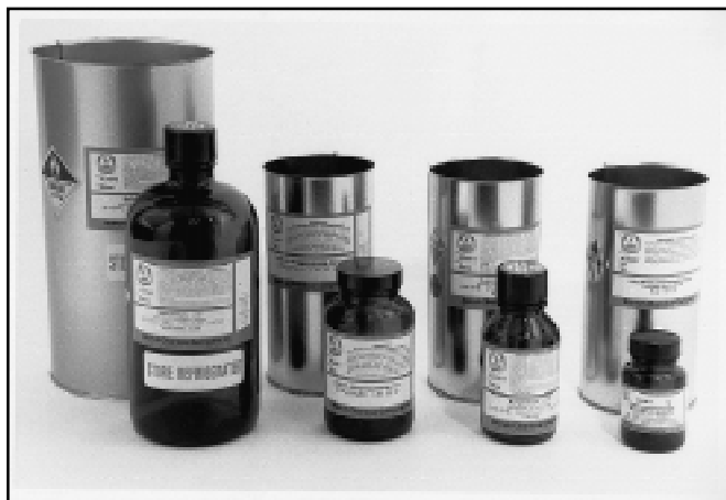
Fig. 1 Pyrophoric reagents may be packed in a variety of containers.