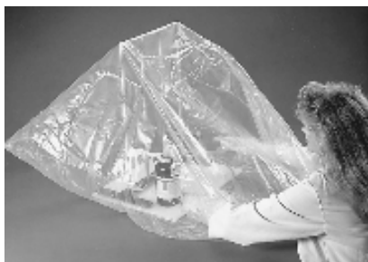
Two-hand AtmosBag shown here with Benchrack lattice system.

The Aldrich AtmosBag is a 0.003-in. gauge PE bag that can be sealed, purged, and inflated with an appropriate inert gas, creating a portable, convenient, and inexpensive "glove box" for handling air- and moisture-sensitive, as well as toxic, materials. Other applications include dust-free operations, controlled-atmosphere habitat, and, for the ethylene oxide-treated AtmosBag, immunological and microbiological studies. Small AtmosBags have one inlet per side. Includes instructions.